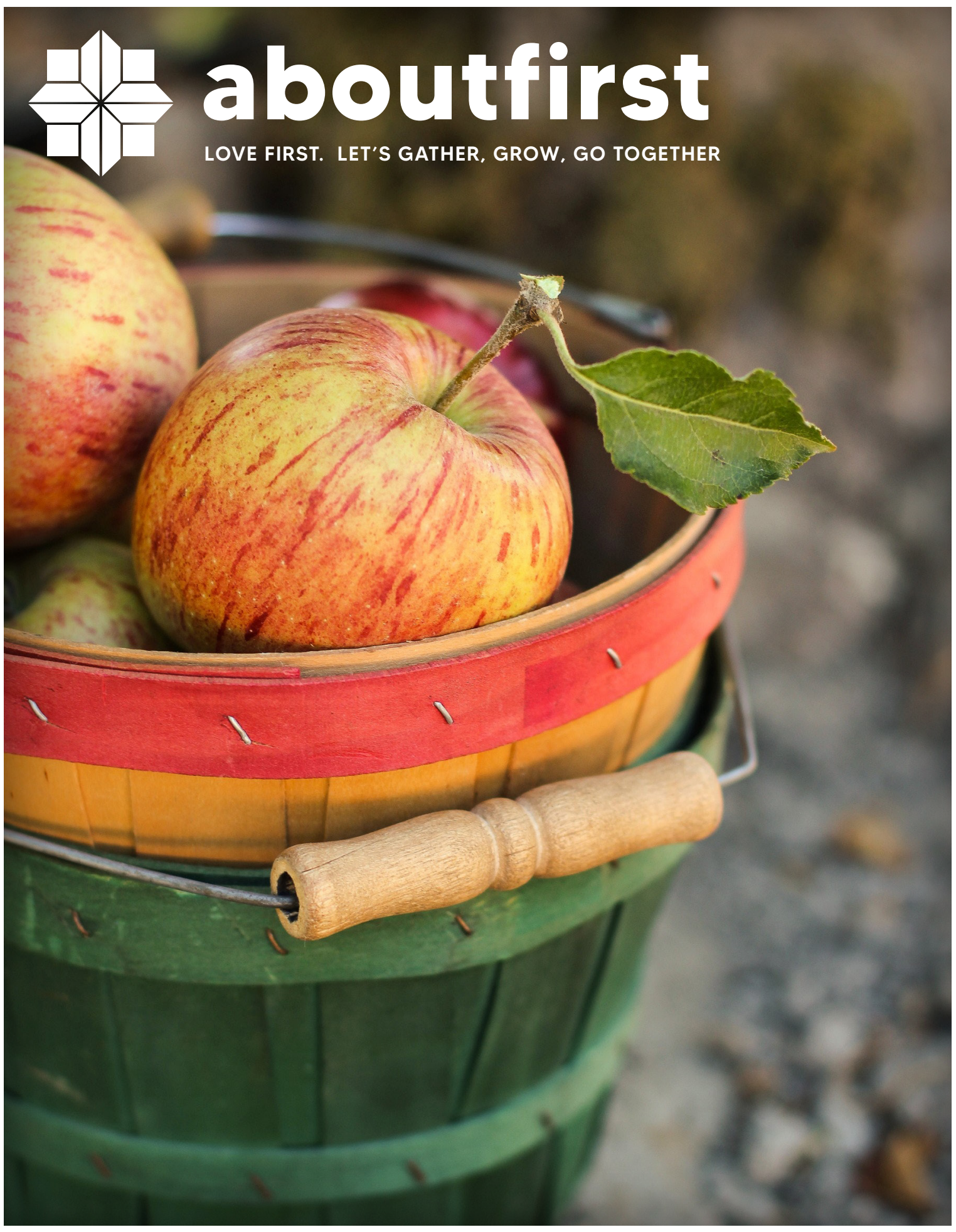
SEPTEMBER 2023, FIRST UNITED METHODIST CHURCH, CEDAR FALLS