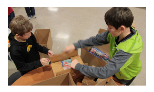
There's work for everyone at the Ingathering kit-packing stations.

Don't feel you need to complete a kit. If you find a good deal on any of the items go ahead and buy a bunch. Bring the items to the collection site at the back of the Welcome Center at church.