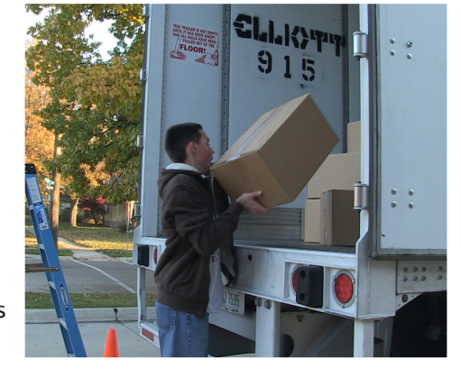
United Methodists from all over Iowa help pack and load donated items @ Ingathering