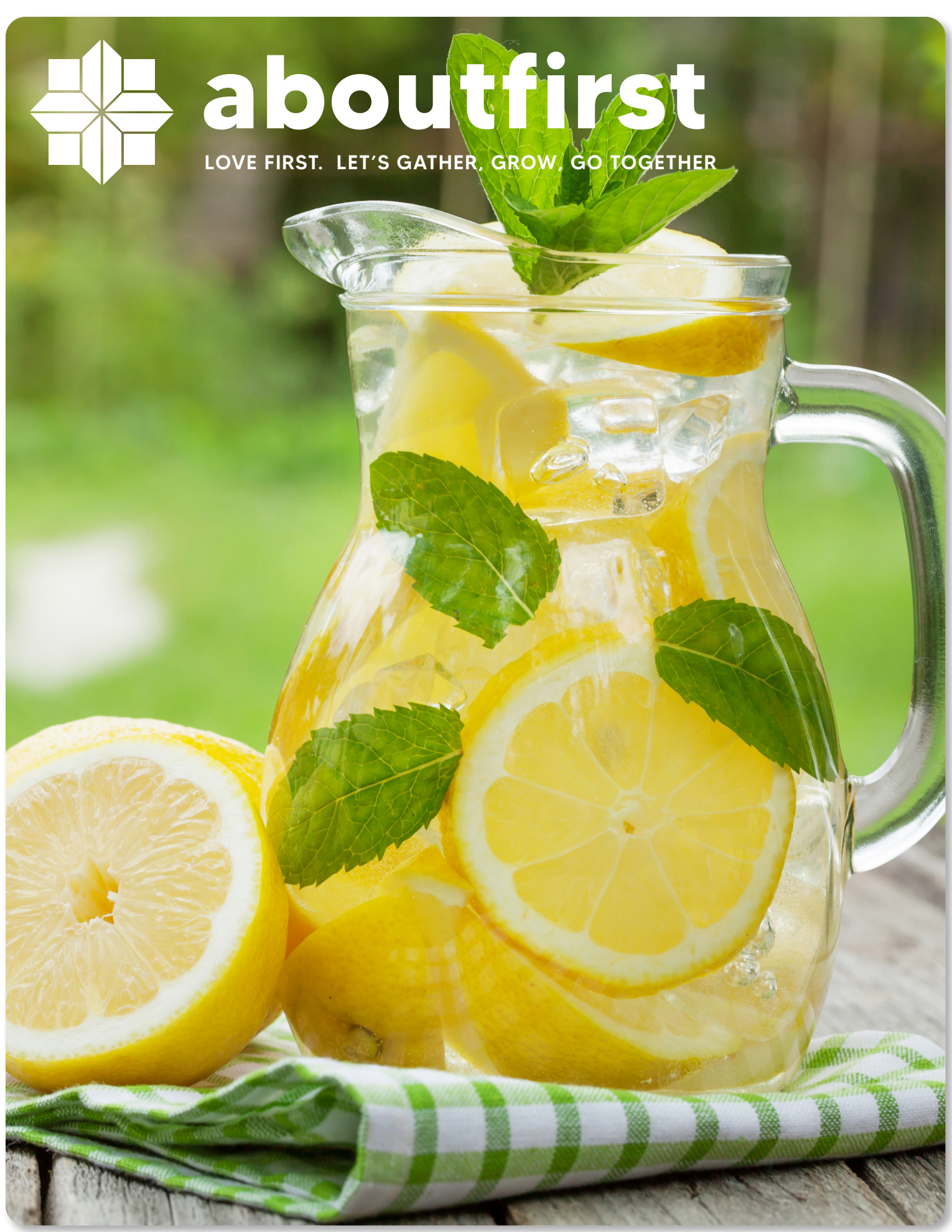
JULY 2023, FIRST UNITED METHODIST CHURCH, CEDAR FALLS