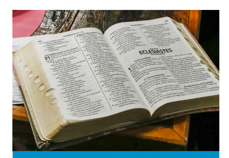
January Bible Verse Do not let your hearts be troubled. Trust in God, trust also in me. John 14:1